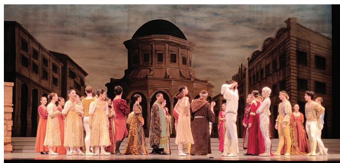
Final rehearsal on stage. Listening to Artistic Director's instruction (Romeo & Juliet 2020)