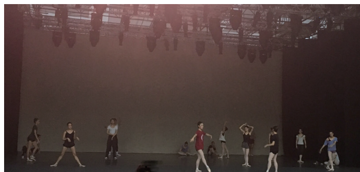
Rehearsal of Ballet Under the Stars (2019). The opulent combination of a ballet and picnic is the best way to pamper yourself.