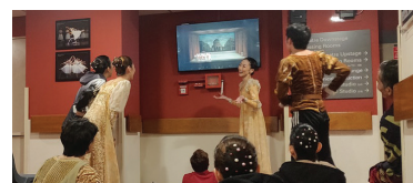
Friendly atmosphere at the back stage (Romeo & Juliet 2020)