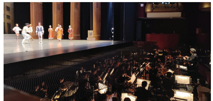
Rehearsal with Metropolitan Festival Orchestra at Esplanade Theatre. Conductor Joshua taught us that playing music to accompany dancers is very different from a classical concert even if it is the same Tchaikovsky. The tempo and the pulse need significant adjustment to accompany the movements of the dancers.