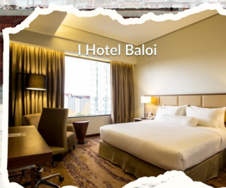
I Hotel Baloi