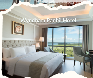
Wyndham Panbil Hotel