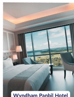
Wyndham Panbil Hotel