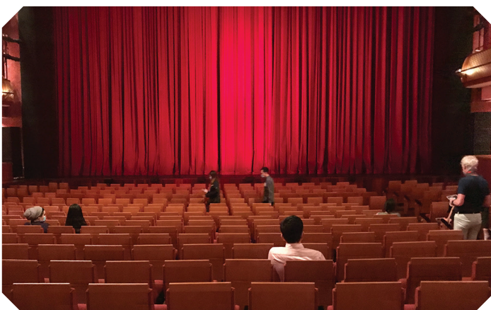
Social Distancing inside the theatre